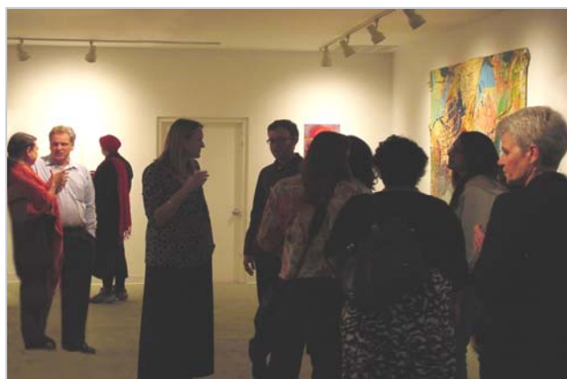
UNO Gallery, St. Claude Avenue

The true measure of our success as artists creating in this New Orleans frontier lies with our courage to challenge our own old conventions, insight to create new traditions and willingness to invent culture again and again and finally our readiness to move to New Orleans: A City of Artists . ❖