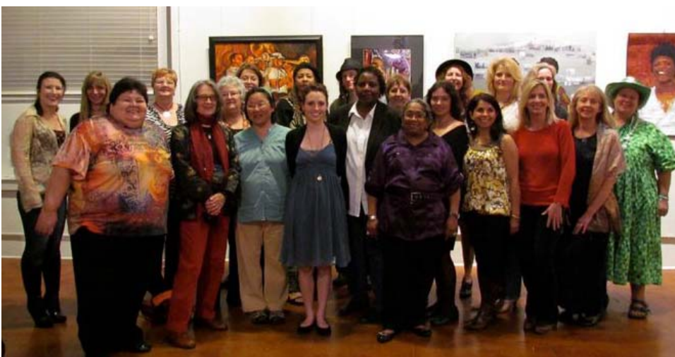
The exhibiting New Orleans women artists of Femme Fest 2011

I am more pleased with this exhibition than any I have ever curated. It is a complex medley of inspired achievement, unique as individual pieces, with a much stronger harmony as a whole. I salute the achievements of New Orleans women artists and thank you all for your participation in one of the best art shows in New Orleans.