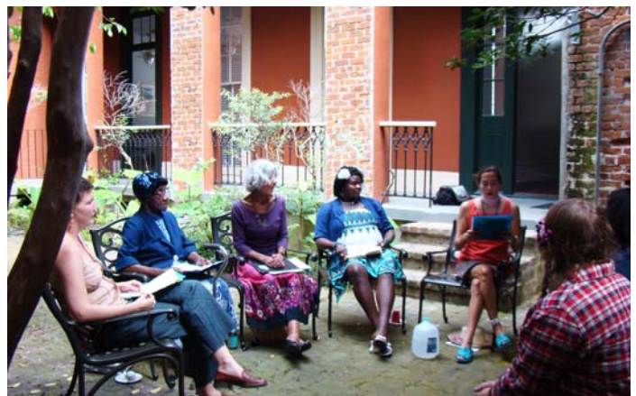
Poets and Writers, Inc., at Jazz and Heritage Foundation salon

The New Orleans Avant-Garde ® is a grassroots visionary quarterly written by artist-writers who use the creative process to inspire community. Writer/poet inquiries regarding written contributions are invited. Ad space is available for art/culture-related ads; please inquire for pricing. Distributed in New Orleans at select galleries, coffee shops, universities and online at http://www.AvantgardeU.com/